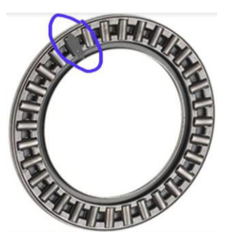
Figure2: Accepted bearing bearing.